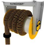
Retractable Hose Reel Manual or Motorized

Retractable Hose Drop Products, Manual / Motorized Hose Reel Systems, Flexible Ducting, Hoods. Use for Auto/Truck Repair, Construction Equipment, Heavy Duty Trucks, Bus Garage, Manufacturing Plants, Motorcycle Shops, D.O.T. Facilities, Fleet Maintenance, Locomotives.