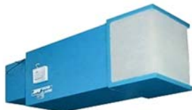
Ambient Air Filtration

Ambient Air Filtration Units, Fume Extraction Arms for Welding, Small Engine Repair, Grinding, and Sanding Fume Exhaust