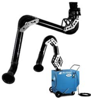
Small Engine / Weld Fume Exhaust Arm