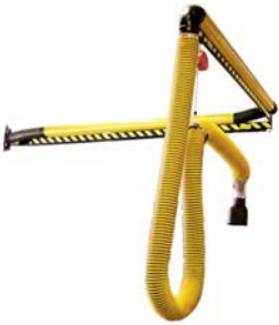
Retractable Hose Drop with Optional Boom