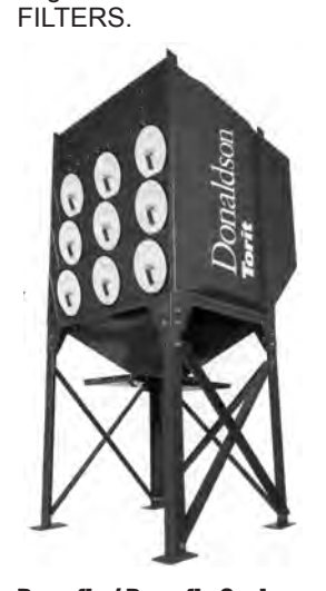
Downflo / Downflo Oval

Cartridge Filter Dust Collectors High efficiency / downflo designs, continuous / intermittent duty, the original ULTRA WEB NANOFIBER